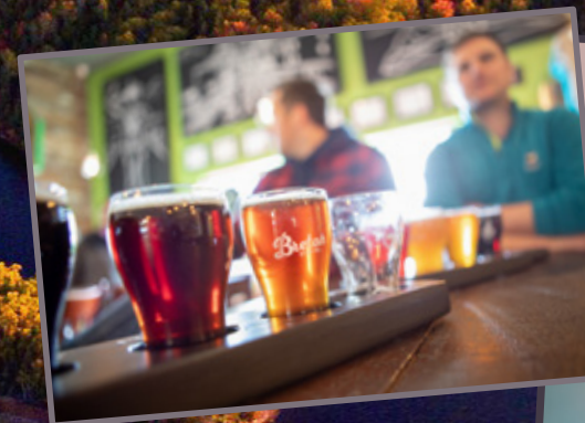
Breton Brewing Co. Sydney

► Thursday-Saturday • 6:30am-9:00pm ► Sunday • 11:00am-1:00pm Closes: October 31