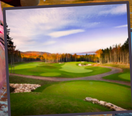
The Lakes at Ben Eoin Golf Club & Resort Ben Eoin

ALL LISTINGS ARE OPEN YEAR-ROUND UNLESS OTHERWISE STATED.