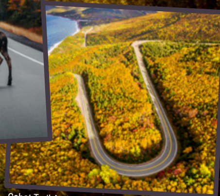
Cabot Trail Aerial