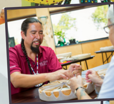
Membertou Heritage Park Membertou

► Every Wednesday • 7:30pm Closes: October 28